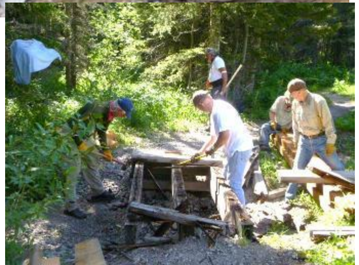
Before and After—the Park Service Model