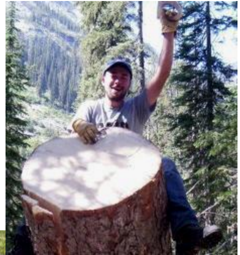
The blow-down had big diameters.