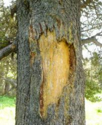
Plenty of Bear Warning Sign