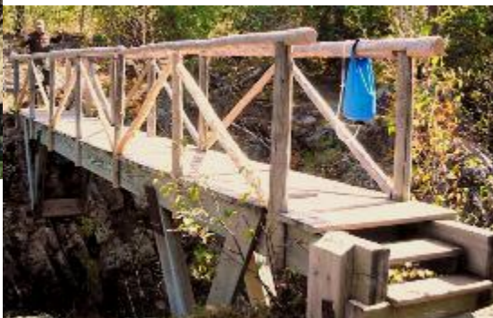
Canoes and portages in lieu of horses and mules in the Boundary Waters Wilderness.