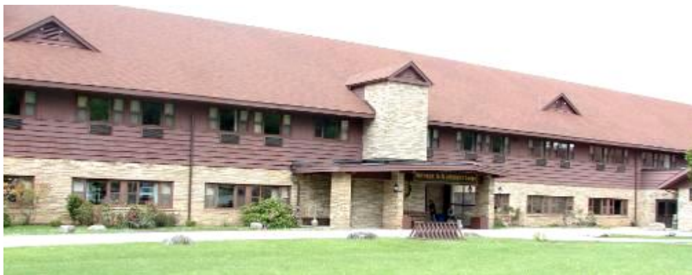
Spatial living at Blackwater Lodge