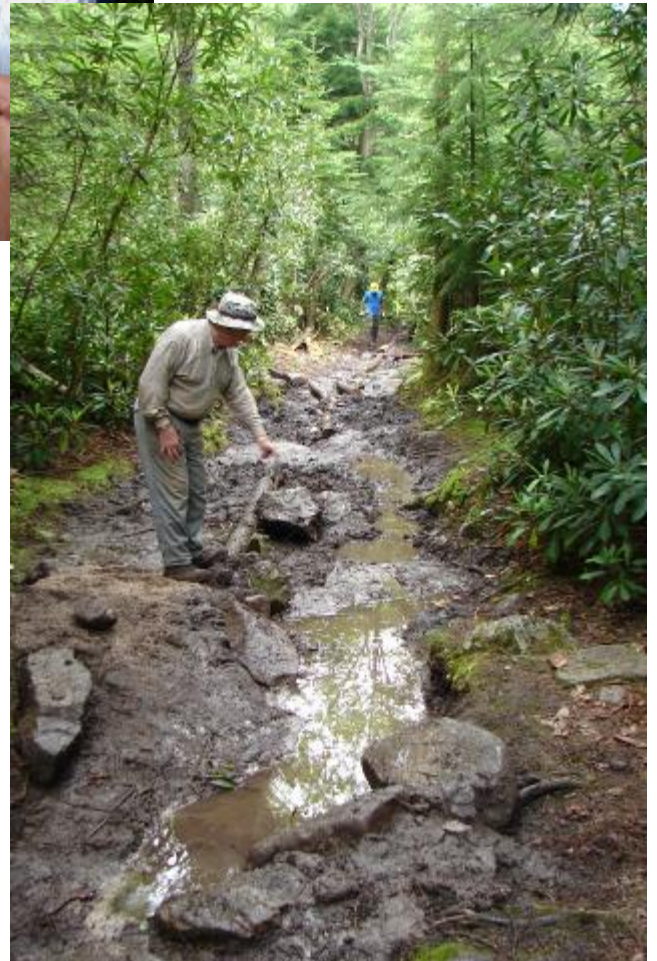
“Looks Like a Jungle to me”