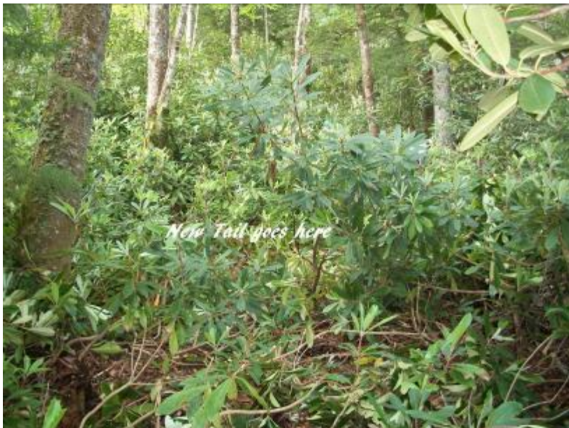
“New Trail Goes Here”