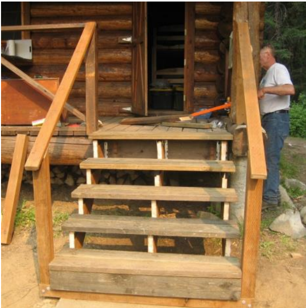
The new stairs with unidentified crew member.

Step #2 required digging two holes, 20-to-25 feet apart. Each hole was to be 18 inches in diameter (to accommodate the reinforcing rebar near the base of the pole) and 24 inches deep (to provide a stable concrete base). After about six inches of easy digging, we hit rock. We widened the diameter of the hole to about 36 inches without finding any indication that we were getting close to the edge of the rock. When digging a hole, you have to be smarter than the rock, so we moved the hole. We successfully managed to dig down about 18 inches before hitting rock. After widening that hole, we decided, with Nate's concurrence, that 18 inches would be deep enough because, if we were hitting bed-rock, there was little concern for frost heave.