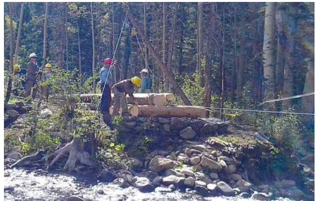
The crew ready to haul bridge components across the river.

In summary, the New Mexico Smokejumper Trail Project team(s) have established quite a reputation over the past 3 years. A total of 7 projects and two great news articles in local papers are the talk-of-the town and in the Santa Fe and Carson National Forests. We hope to continue that reputation as demand for our services continues to grow.