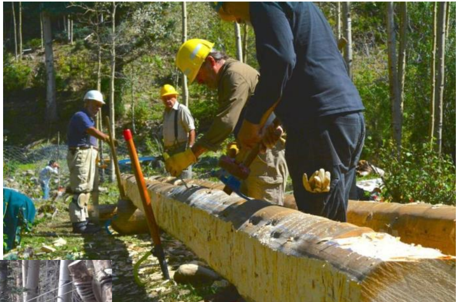
Jumpers working on a stringer for the bridge.