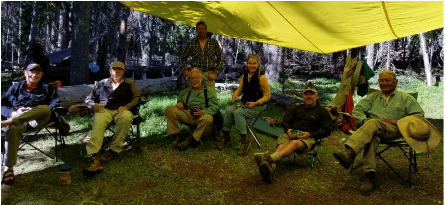
San Pedro parks 2017 team