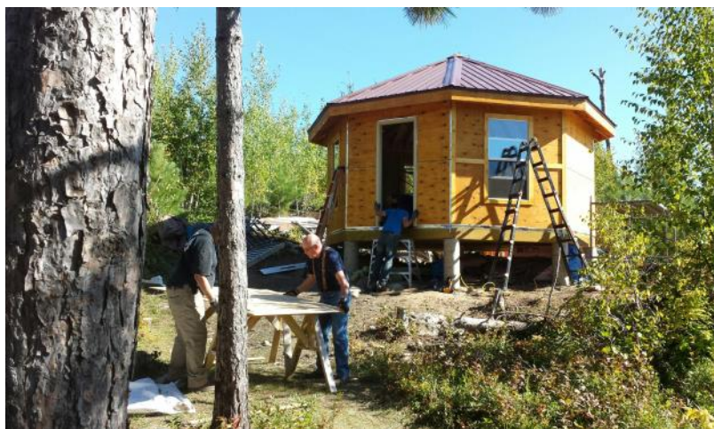
Above—Yurt construction crew above positive IDs not possible.