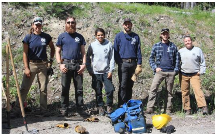
The AmeriCorps crew