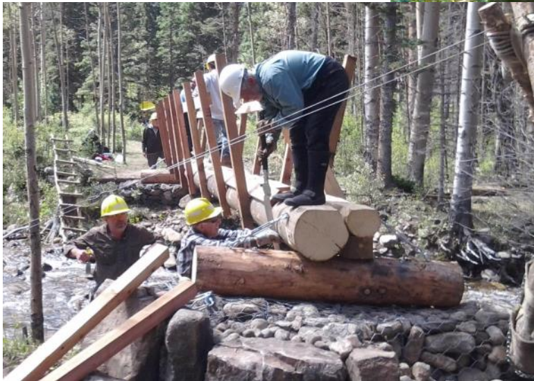
Bolting the stringers on the bridge.