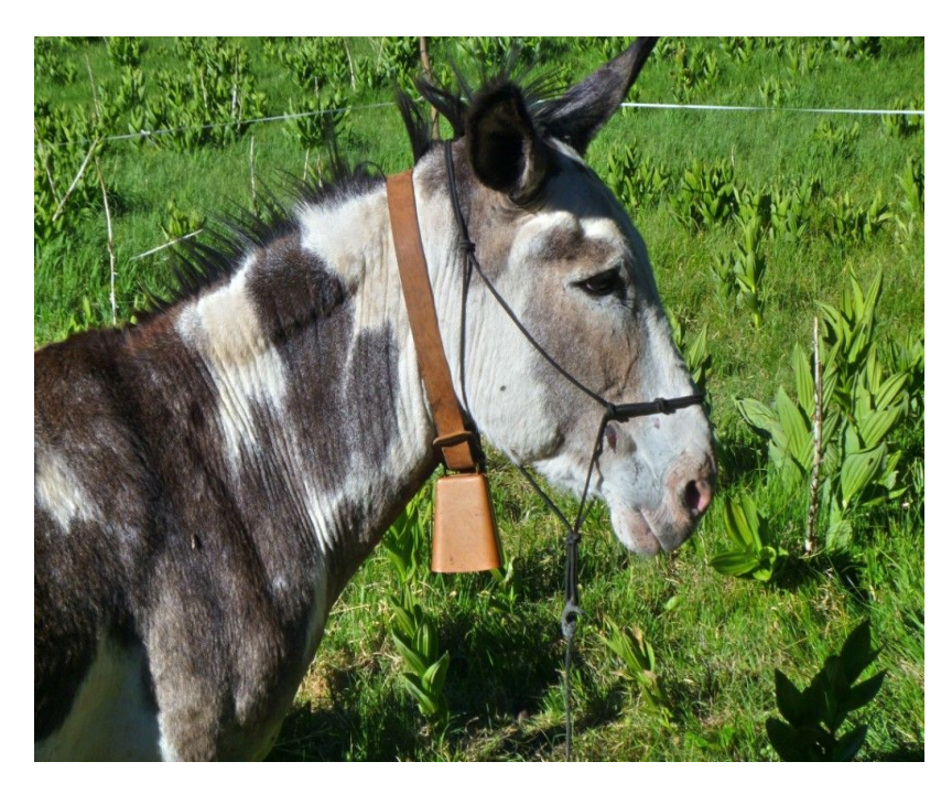
Slim our mascot of the week!