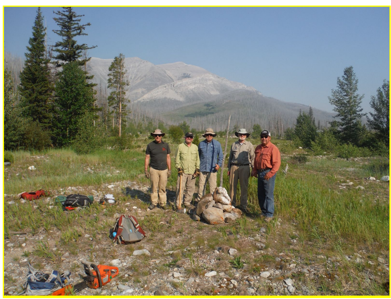
Part of the trail had washed out and we had to build rock cairns to mark the trail

The crew started early the next two days because of high heat warnings of over 90 degrees and lack of any shade for breaks. But, in spite of the heat, finished the assigned trail work a day early. Lon, the detail man, had brought some extra equipment that he knew we needed to repair the log fence at the entrance to the compound and when we left it was a much more attractive first impression. We said we would paint the cabin, but no one could round up any paint and brushes for us at short notice. Some of the most avid fishermen hiked back down the canyon to drift a fly at some deep holes in the canyon and some big cutthroats couldn't resist the skill of the anglers.