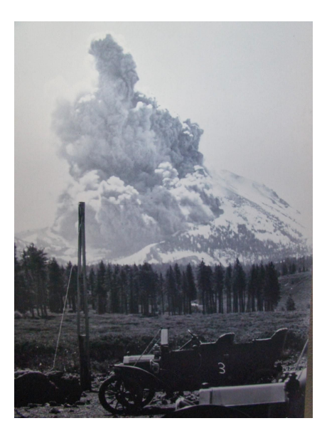
Mount Lassen eruption 1915-16

NSA CA TRAMPS look forward to the 2019 opening and closing of the Volcano Adventure Camp for kids in Lassen Volcanic National Park. Along with good works in the woods and nostalgic return to smokejumper camaraderie, NSA is helping with a great cause for kids not otherwise having a chance to get out in the woods.