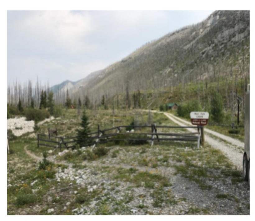
This is the Forest Service cabin where we stayed. We also redid the gate entrance

Fred, Lon, John, and I drove up to the cabin, leaving the creek bottom and trees and entering a huge old burn and mountain sides covered with ghostly white branchless lodgepole pines. We stopped to cut some poles for Lon's thermal shower and wondered how old the burn was. Based on the condition of the snags and the regrowth, I estimated about 10 years. When we the reached cabin. the occupants were cleaning and packing. We told them not to hurry. We scouted the area and began setting up the wall tents. At 1:00 p.m. the guests left and we started moving into the cabin and began kitchen. assembling the