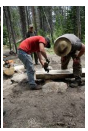
The logs were top surfaced for walking, notched for assembly, timber locked, and rock-locked in placed